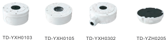
TD-YXH0103 TD-YXH0105 TD-YXH0302 TD-YZH0205